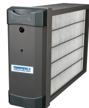
Air Purifier (Optional)