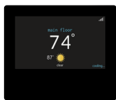
Ion Black System Control

The Ion 21 Air Conditioner with SmartSense Technology operates best when matched with a compatible, communicating indoor unit and the Wi-Fi-enabled Ion Black System Control. All of the components of this communicating system work together to deliver exceptional comfort and energy efficiency. When this air conditioner is installed as part of a complete Ion communicating system, your home will operate at exceptional comfort levels no matter the temperature outside.